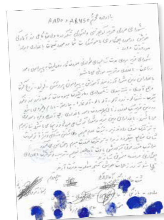
AADO regularly receives letters like this one from village women requesting literacy training.