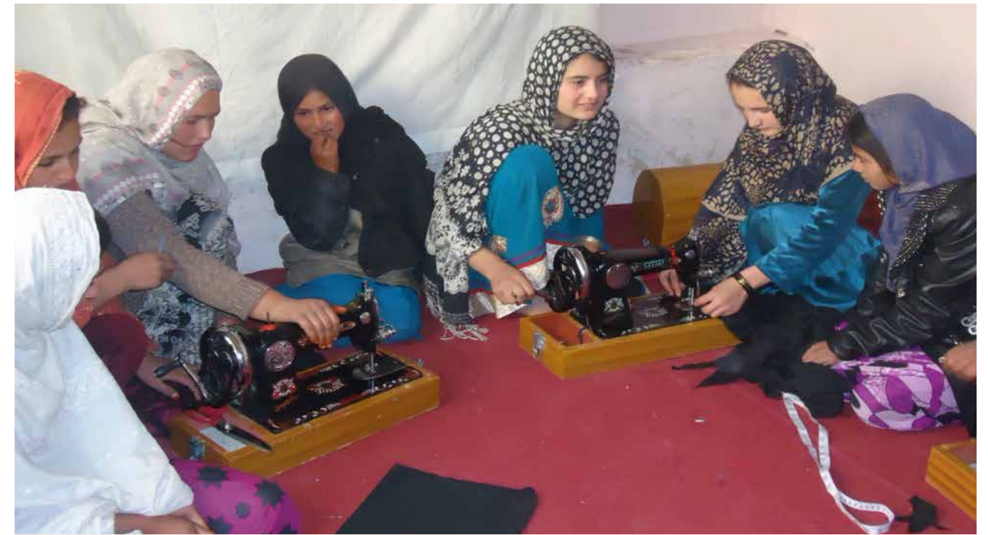
The women receive their own sewing machine upon graduation.